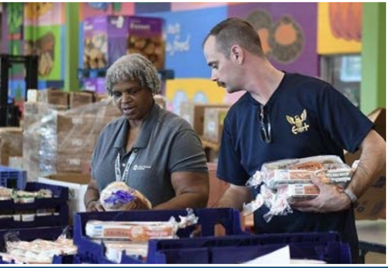
Navy Week - PCU Cleveland sailors volunteer at the Greater Cleveland Food Bank.