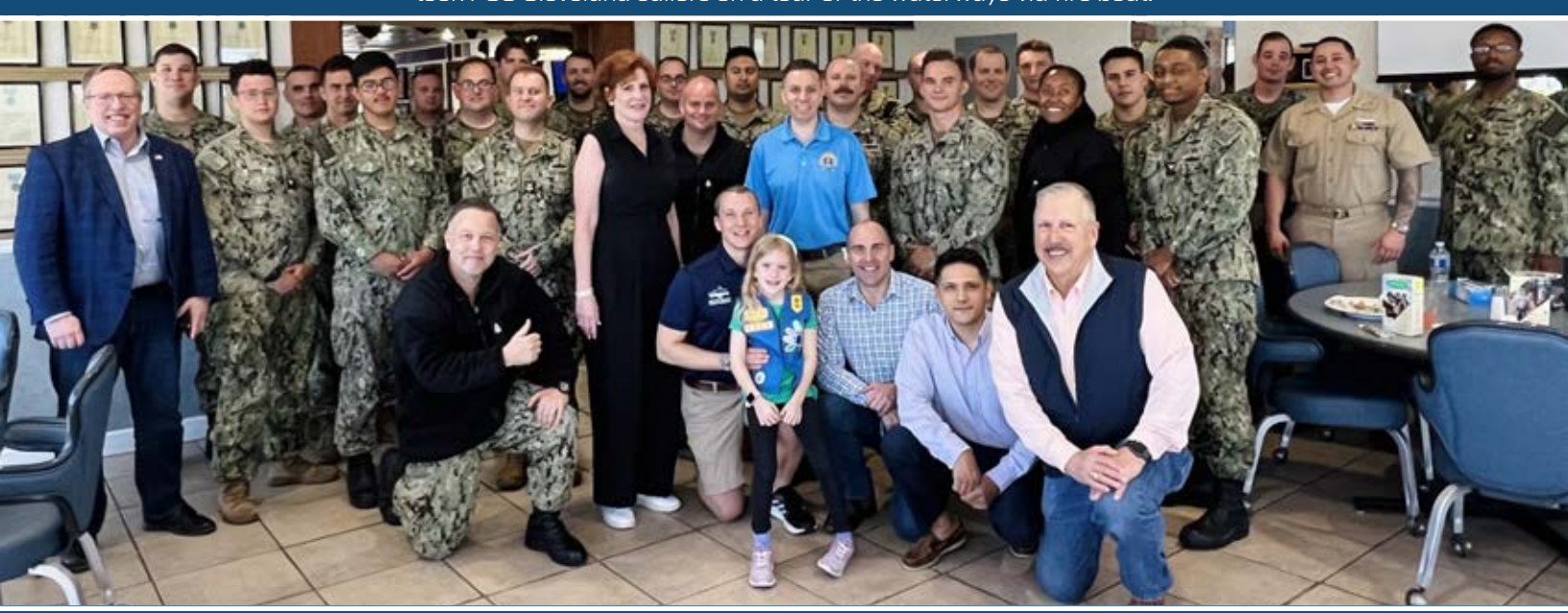
Above: Annual Strategic Planning Retreat at Naval Station Mayport