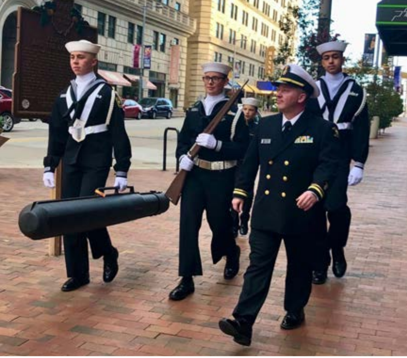
Navy Ball - The oldest and youngest sailor in the room.