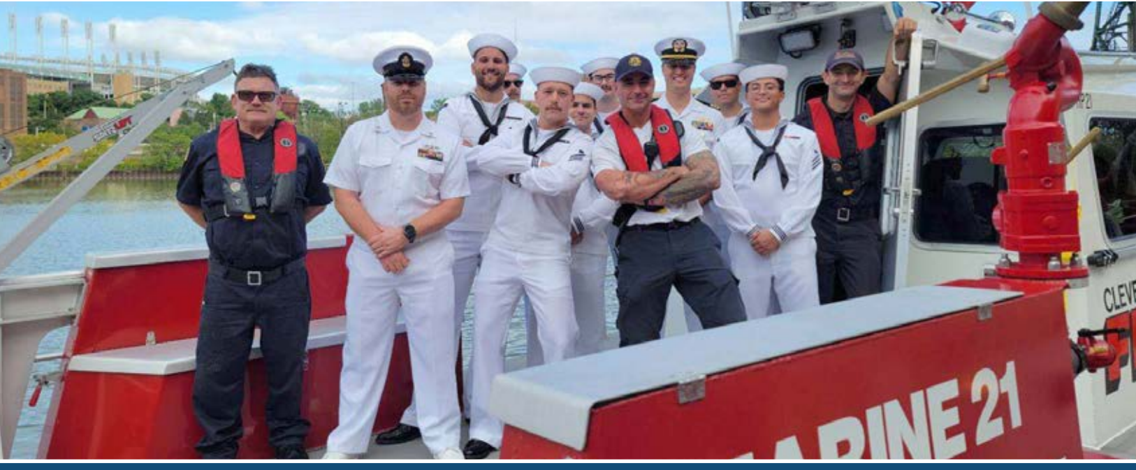
Above: Navy Week - Cuyahoga County Office of Emergency Management personnel took PCU Cleveland sailors on a tour of the waterways via fire boat.