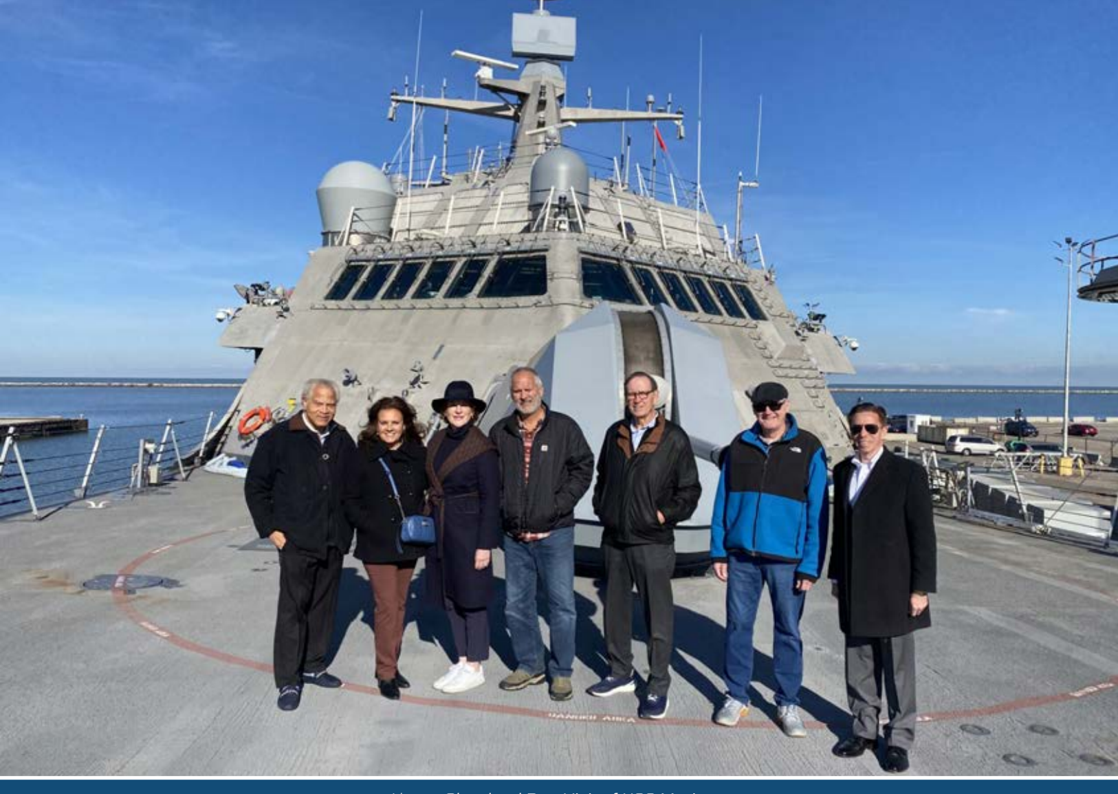
Above: Cleveland Port Visit of USS Marinette